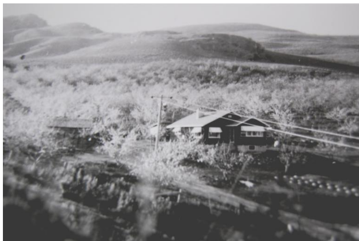
Figure 3: Davison Orchards 1949