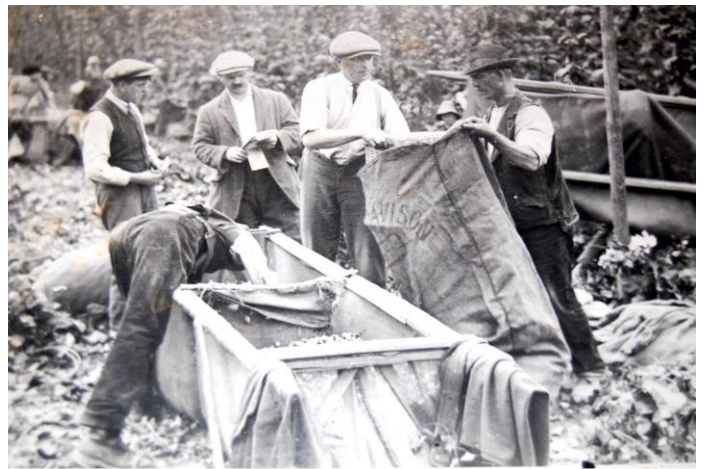
Figure 1: The Davison Farm Tunbridge Wells, England early 1900s